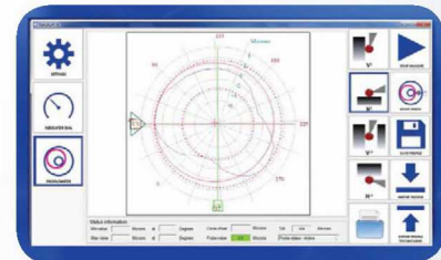
CalcuSurf 2D™ v2.0 Profiling software for LAS™ stations with USB integrated electronic contact probes